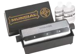
ZH080 8" (20 cm) Multi Hone™ 6 oz. Honing Oil