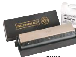
ZH110 11" (28 cm) Multi Hone™ 16 oz. Honing Oil

Contains 3 Stones and Honing Oil (Replacement Parts also available - see price sheet)